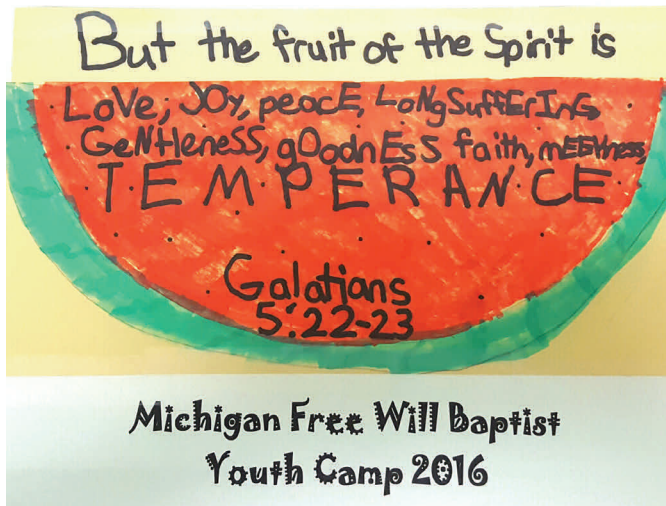
**Design the Theme Winner: SAVANNA CALLAHAN** Woodhaven FWB Church