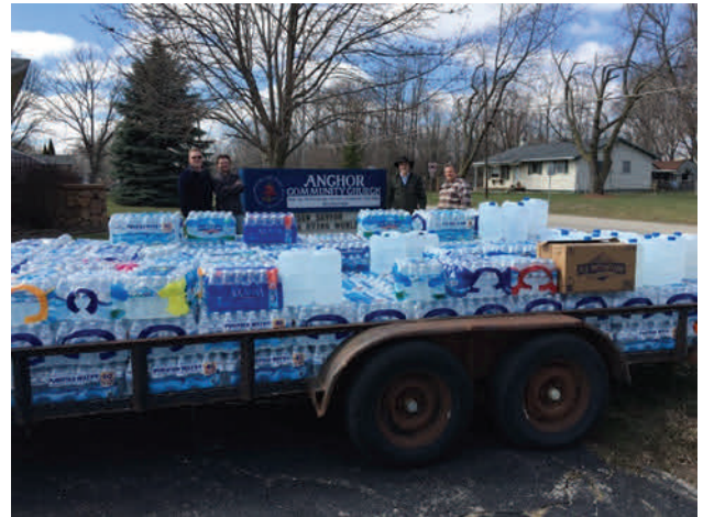
The Fellowship District donates 3 1/2 pallets of water and delivered it to the Anchor Community Church in Burton.